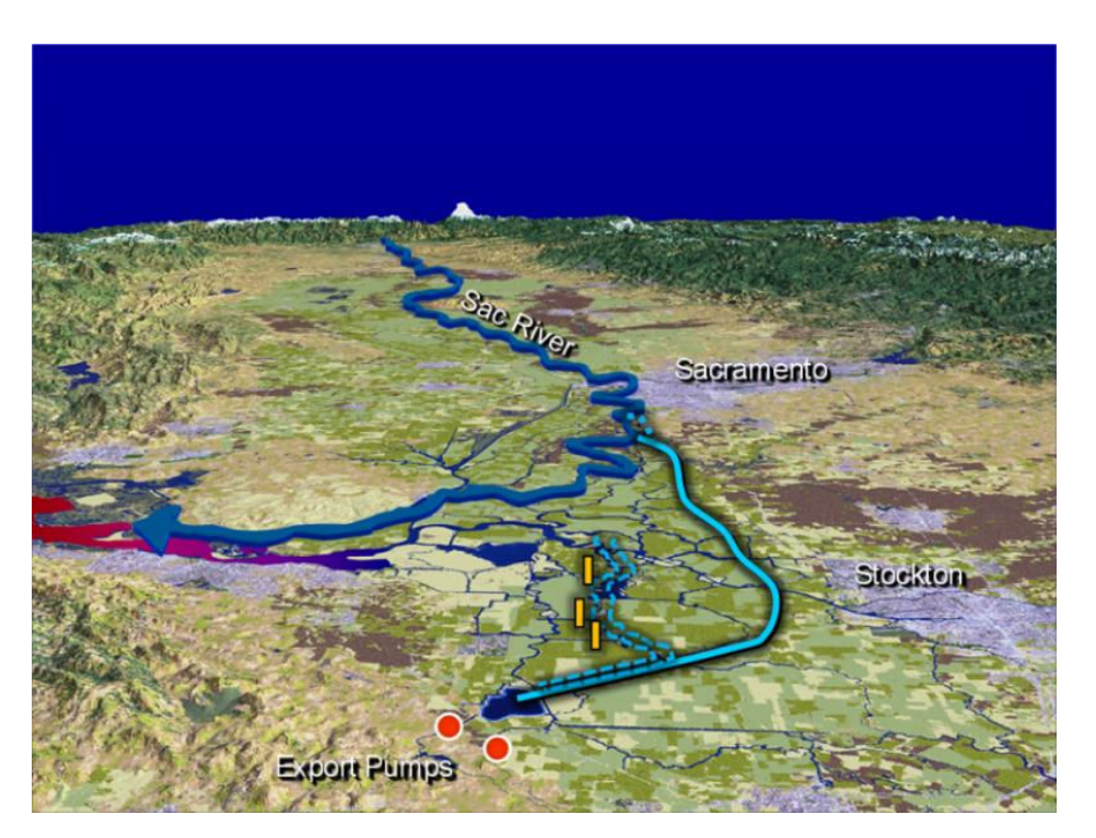
Figure 4 Alternative Conveyance Facilities for the Delta

Fourth, alternative conveyance facilities (along the lines illustrated in Figure 4) need to be built. Conveyance capacity should be limited to the minimum required to meet export needs on a flexible basis. A canal much smaller than the one proposed in 1982 would reassure